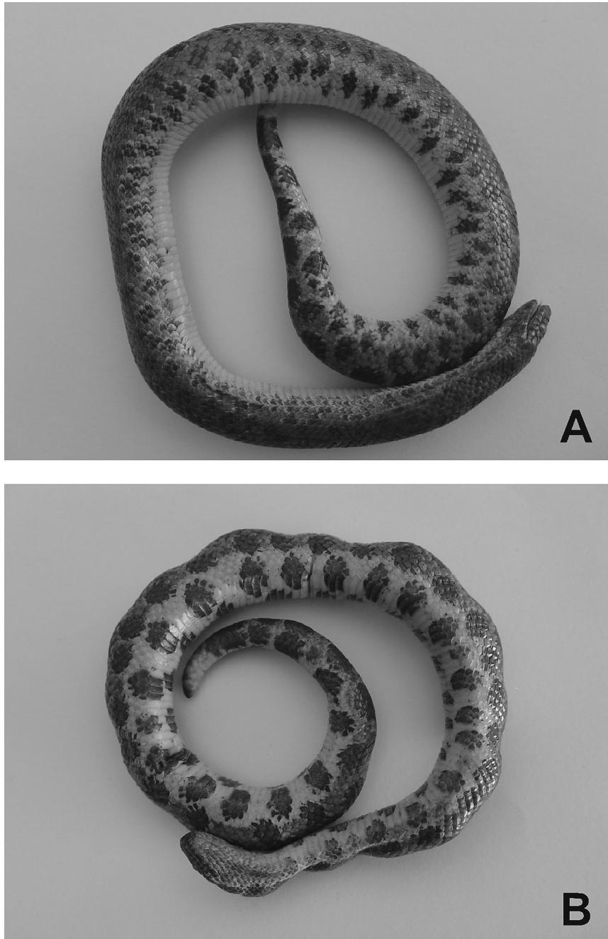
Figure 1. Lateroventral view of Tropidophis xanthogaster (holotype, A ) and Tropidophis pardalis (CZACC 4.12013, B ).